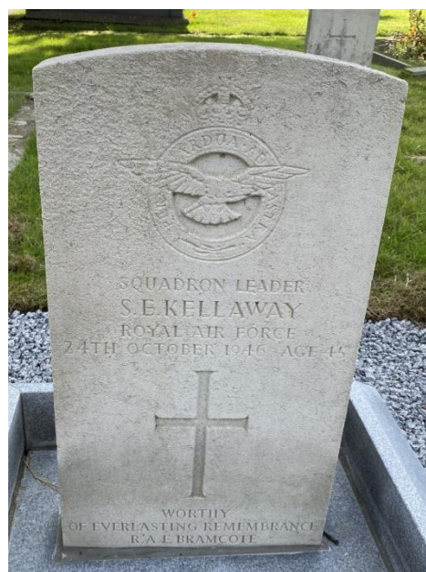
St Catherine's Churchyard